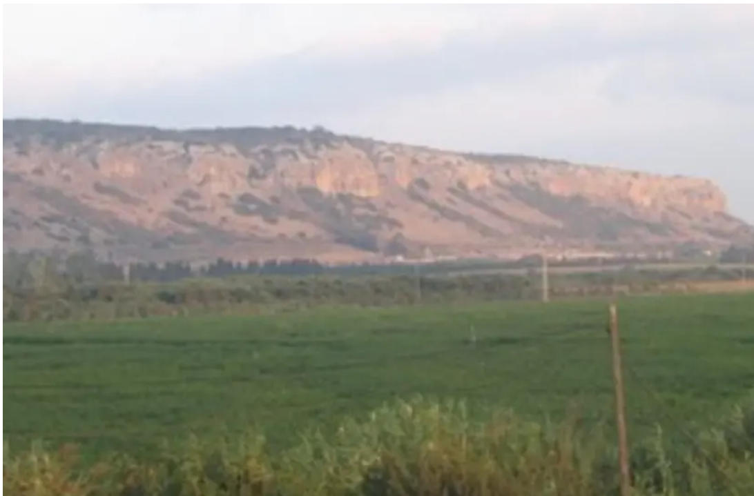
Mount Carmel 311

According to NASA's Goddard Institute for Space Studies the temperatures across the planet between December 1, 2009, and November 30, 2010, show that 2010 ranks as the hottest year on record. And clearly after the worst-ever forest fire on Mount Carmel few Israelis would dispute the consequences of rising temperatures, prolonged droughts and intense heat waves.